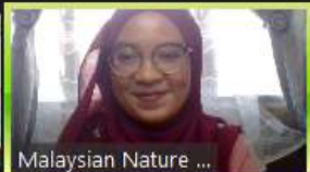
Malaysian Nature ...