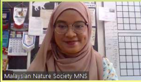
Malaysian Nature Society MNS